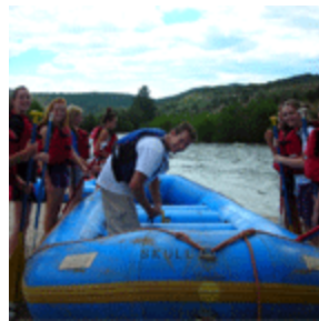
White Water Rafting