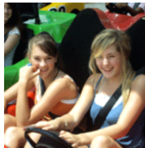
Trip to Fun Factory